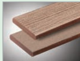
Actual dimensions 1" x 5-7/16"