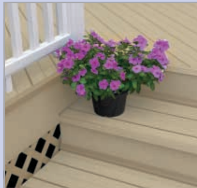
Fascia and Mouldings

TimberTech has a complete line of accessories to accentuate your deck and supply you with creative design capabilities.