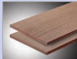
Actual dimensions 9/16" x 10" or 9/16" x 12"